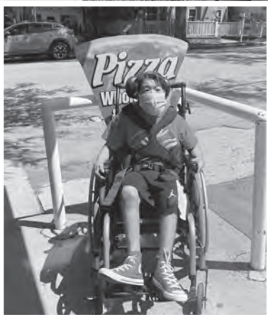
▲ A DAY AT THE PARK!!!